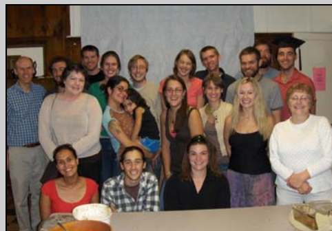
Class of 2007 graduation potluck