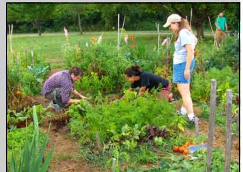
digging potatoes in August