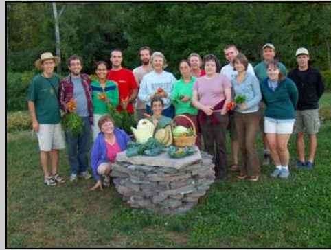
at Ethan Allen Homestead

Images from the 2007 Community Teaching Garden, a 20-week program sponsored by Friends of Burlington Gardens with generous grant support from the Sid and Cecelia Lance Family Foundation, VCF Sustainable Future Fund, Merchants Bank Foundation, and Gardener's Supply