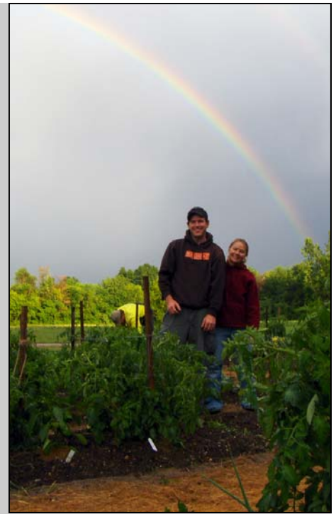
a place of learning and service