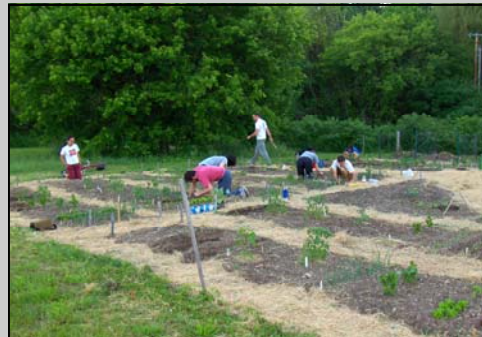
planting garden beds in May