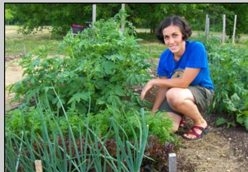
a delicious harvest in July