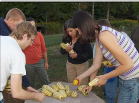
sharing squash in September