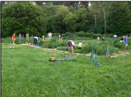
weeding and cultivating in June