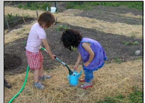
watering with the children