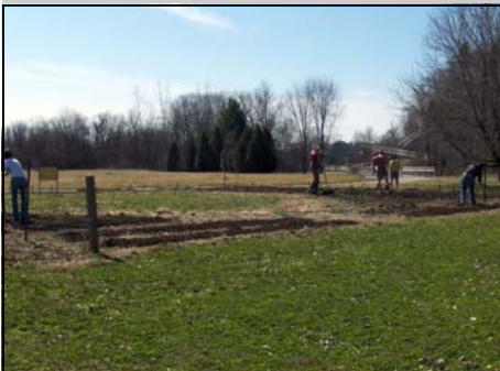
turning over the soil in April