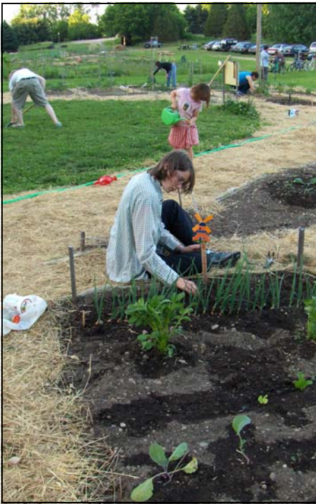
a field of garden dreams

Images from the 2007 Community Teaching Garden, a 20-week program sponsored by Friends of Burlington Gardens with generous grant support from the Sid and Cecelia Lance Family Foundation, VCF Sustainable Future Fund, Merchants Bank Foundation, and Gardener's Supply