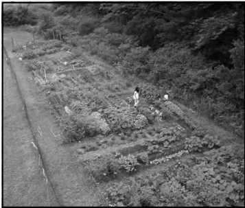
The School of International Training Community Garden in Brattleboro is one of 23 new community and school gardens started this year in Vermont.

The Vermont Community Garden Network received a fertile boost in January and February 2007 through a $15,000 grant from The Bay and Paul Foundation and a $5000 gift from The Ben & Jerry's Foundation.