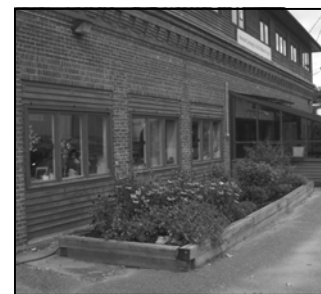
The garden bed in front of 180 Flynn Avenue is now an urban oasis for bees and butterflies.

Through a donation of perennials from Gardener's Supply and the volunteer efforts of the GSC marketing department, a pollinator garden was installed June 8 in front of Friends of Burlington Gardens new office space at 180 Flynn Avenue in Burlington. NWF Habitat steward Char Albers adopted the new garden and helped it become certified as an official NWF wildlife habitat.