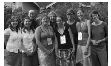
A 10-member VCGN delegation attended the 28th annual conference of the American Community Gardening Association in Boston August 9-12.

FBG Plant Sales are a favorite for Burlington area gardeners.